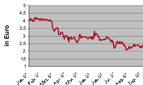
Performance of ADLER AG since beginning of the year

The performance of ADLER stock has been unsatisfactory in this view, as the stock price has dropped sharply since the beginning of the year. As of September 30, 2007, ADLER stock was quoted at EUR 2.38. This corresponds to a price/earnings ratio of just to below 5 using net earnings as of September 30, 2007. One can only hope that the financial market will adjust its very low valuation sooner or later.